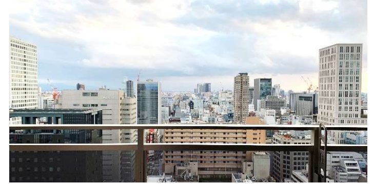
Great View of the Dotonbori and Shinsai-bashi area from the balcony.

Property Name: CREVIA TOWER OSAKA HONMACHI #2502